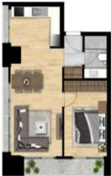
1+1 TİP 5 A BLOK