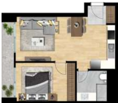
1+1 TİP 4 A BLOK