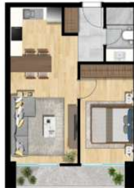
1+1 TİP 2 A BLOK