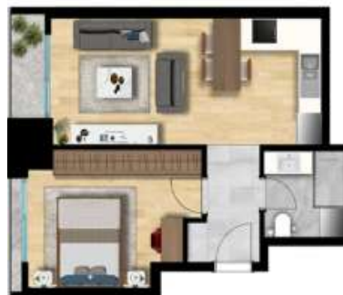
1+1 TİP 1 A BLOK