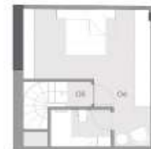
1+1 D KAT