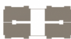
C1 C2 C3 C4 Blok Standart Kat