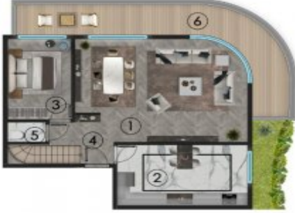
TERAS DUBLEKS DAİRE ALT KAT TERRACE DUPLEX APARTMENT GROUND FLOOR