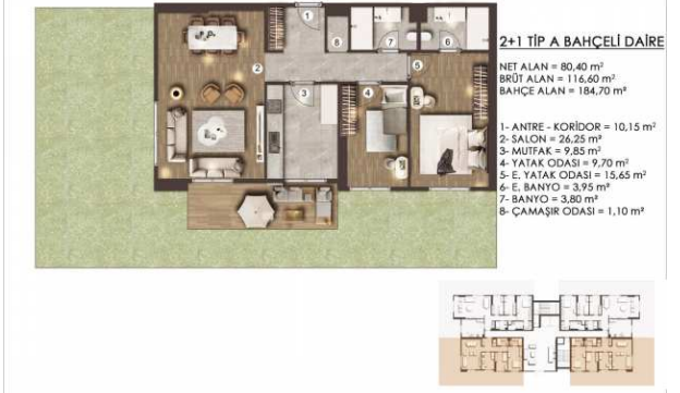
ZEMİN KAT PLANI