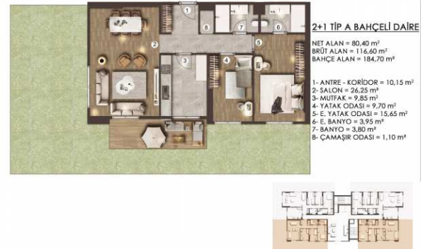
ZEMİN KAT PLANI