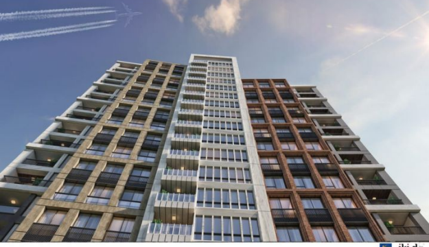
AVRUPA KONUTLARI SAKLIVADI PROJESİ