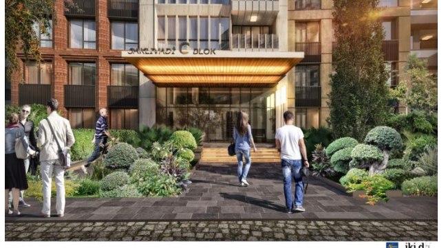
AVRUPA KONUTLARI SAKLIVADI PROJESİ